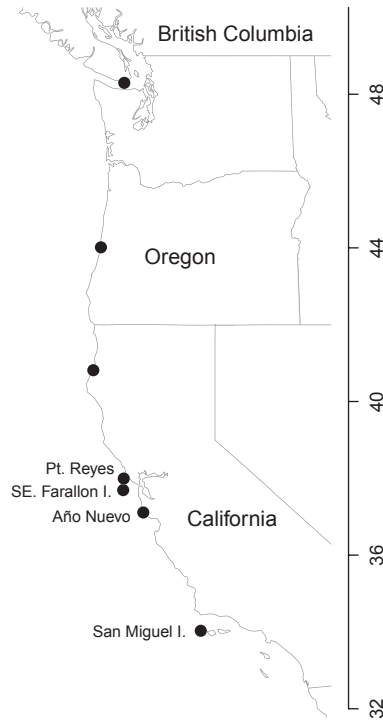
Figure 1. Locations where branded northern elephant seals were observed, including the tagging location at Año Nuevo, where most were resighted. Three other elephant seal breeding colonies are labeled. Branded animals bred at two, Pt. Reyes and SE. Farallon I., but not at San Miguel I., where only one juvenile was observed. The other sighting locations are not breeding colonies. Two sightings are not on the map because precise locations were never provided, one in Oregon and one in Central California. The latter was the animal that eventually died at a rescue center. Latitude is indicated to the right.

regression (5–16 yr in females, 1–15 yr in males) intended to produce the best-supported estimates for future modeling studies. All models were run separately for males and females.